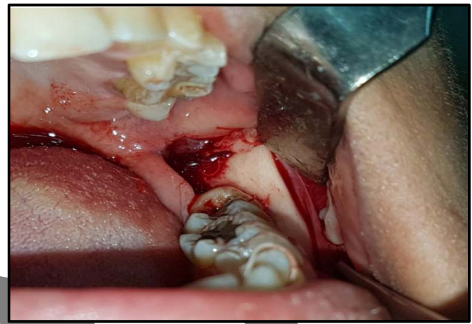
Figure (1): Clinical picture showing elevation of buccally based triangular flap.