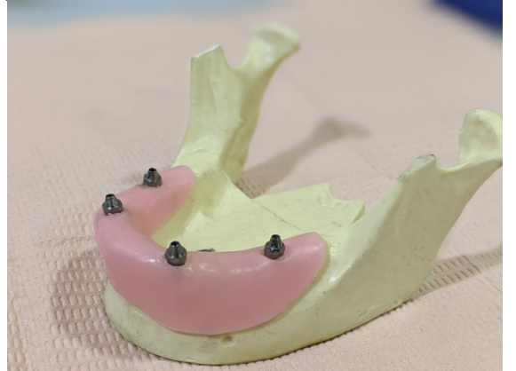
Figure 1: Four one-piece implants with multi-unit abutment after placement in the model using surgical guide.

Mann Whitney test was used to compare between two groups for not normally distributed quantitative results. Significance of the presented results was judged at the 5% level.