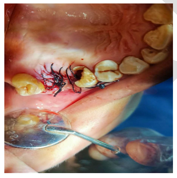
Figure (3): The flap was sutured using silk 3/0 suture material.