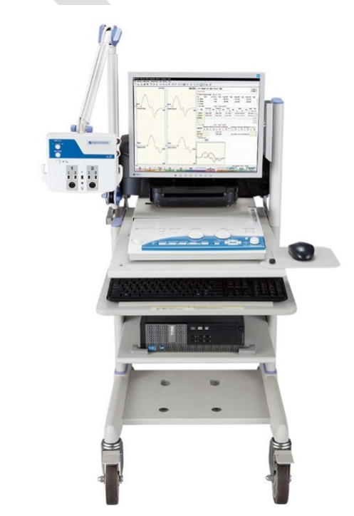
Figure 2: Neuropack 2 electromyograph apparatus (MEB-9400) from Nihon kohden (Japan).