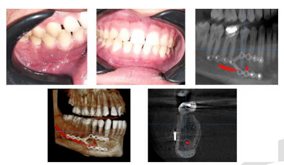
Figure 5 : Postoperative occlusion and CBCT showing healing of the fracture