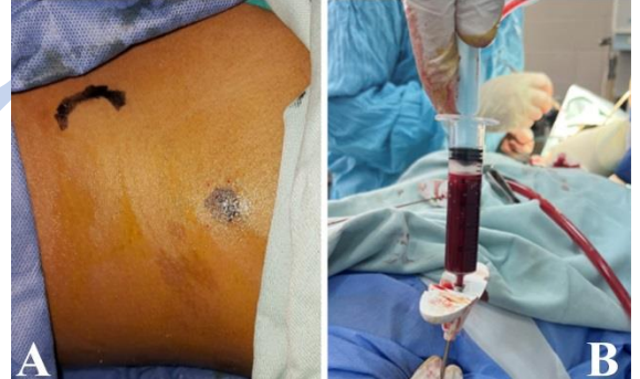
Figure 4 : (A) Examination of the donor site (B) Process of bone marrow harvesting

Figure 3 : complete enucleation of the cyst lining