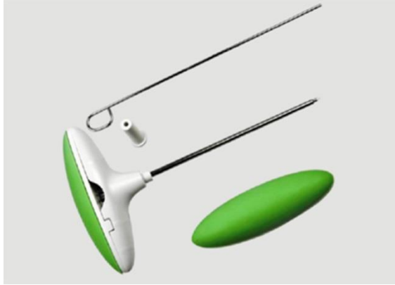
Figure 1: Jamshedji bone marrow aspiration needle for the collection of bone marrow.