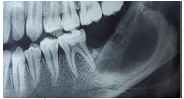
Figure 2: Preoperative radiographic examination

Figure 3 : complete enucleation of the cyst lining