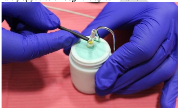
Figure (4): EAL working length was measured after File #15 k-file was inserted into the canal. File touch probe was connected to #15 k-file and the lip clip was connected to the alginate.