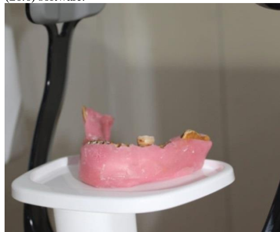
Figure (1): Pink wax was placed on the mandible to simulate soft tissue during CBCT image acquisition.

The normality of distribution was checked by the mean measurements of the working length for actual length, EAL and CBCT. Comparison between actual length and the other methods was done by F test (ANOVA) with repeated measures and by p-value with statistical significance level at p-value < 0.05. Post hoc analysis test (Bonferroni) was performed to differ between each technique. Interclass correlation coefficient was done for intra and inter examiner reliability. Analyzing the data was done by Statistical sciences program SPSS (20.0) software.