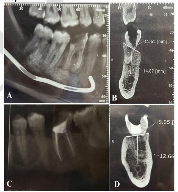
Figure (1): Pre-operative radiographic examination. (A) Pre-operative Panoramic examination (group I). (B) Pre-operative CBCT (group I). (C) Pre-operative panoramic examination (group II). (D) Pre-operative CBCT.

Data were collected and analyzed using Statistical Package for Social Science (SPSS) program (ver 25).(18). Kolmogorov-Smirnov test of normality revealed significance in the distribution of most of the variables, so the non-parametric statistics was adopted.