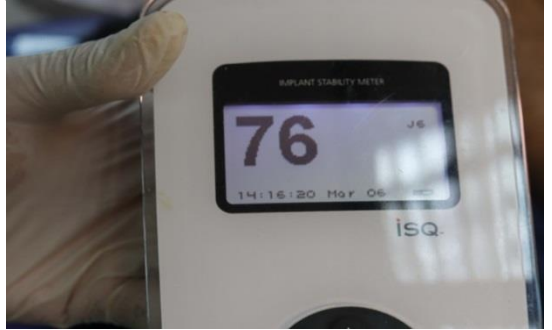
Figure (5): Showing checking implant stability using Osstell®.