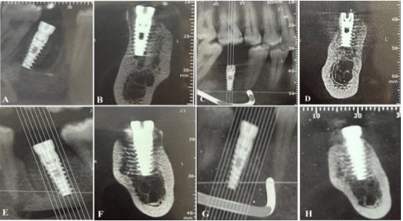
Figure (6): Post-operative follow up phase: (A) Immediate post-operative panoramic view (group I). (B) Immediate post-operative CBCT (group I). (C) Panoramic view after 6 months (group I). (D) CBCT after 6 months (group I). (E)Immediate post-operative panoramic view (group II). (F) Immediate post-operative CBCT (group II). (G) Panoramic view after 6 months (group II). (H) CBCT after 6 months (group II)