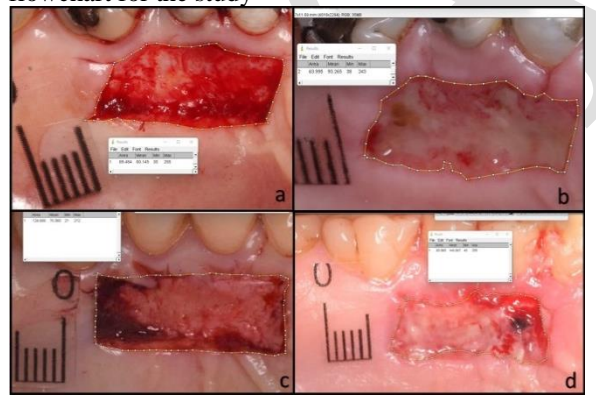
Figure (2): Wound area, photo-digital planimetry: (a, b) control group: a, the day of surgery b, after one week. (c, d) test group: c, the day of surgery d, after one week