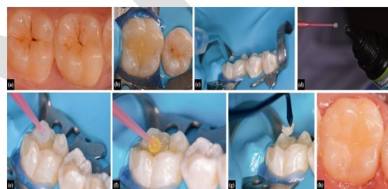
Figure (3): Showing A) class I caries, B) cavity preparation, C) etching, D,E) application of gluma desensitizer, F) application of bonding agent, G,H) composite restoration