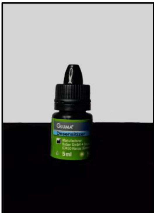
Figure (1): Gluma desensitizer

Teeth that met the eligibility criteria were assigned at random to either of the two groups: Group (I), in which patients were provided with gluma desensitizer and universal bonding agent and composite ( Figure 3 ). Group (II): Patients received universal bond and composite without desensitizer.