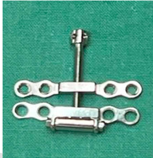
Figure (1): Showing the alveolar distractor

The tests used were paired t-test for normally distributed quantitative variables, to compare between two periods, ANOVA with repeated measures, to compare between more than two periods or stages, and Post Hoc Test (adjusted Bonferroni) for pairwise comparisons, Wilcoxon signed ranks test for abnormally distributed quantitative variables, to compare between two periods, Friedman test for abnormally distributed quantitative variables, to compare between more than two periods or stages and Post Hoc Test (Dunn's) for pairwise comparisons.