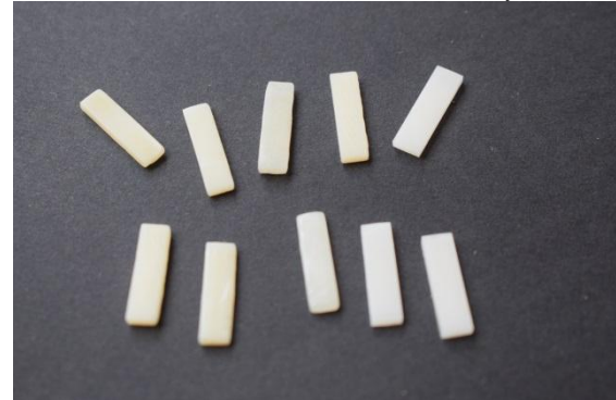
Figure (1): 3D printed specimens printed specimen.

test with Dunn's post hoc test with Bonferroni adjustment was employed to analyze percent change values between groups. All tests were two tailed and the significance level was set at p value < 0.05 . IBM SPSS version 23, for Windows, Armonk, NY, USA was used for data analysis.