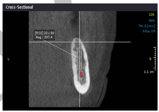
Figure 3: On the selected cross-sectional image, the average mandibular trabecular bone density of the edentulous space was calculated.

Using the obtained cross-sectional cut at the middle of each edentulous area representing a missing tooth, trabecular bone density was obtained using the region of interest measuring tool (ROI) (15) (Fig.3). Cross-sectional slice thickness and measured area size was standardized in all cases. Cone beam computed tomography radiological density of each posterior bounded saddle was considered as the mean of all calculated gray values for each missing tooth region within the bonded saddle (16).