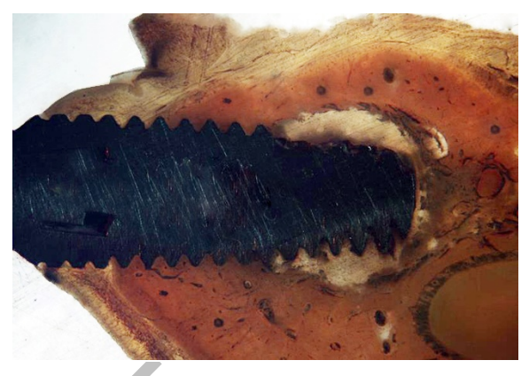
Figure 2: Undecalcified section showing the experimental site was filled with granulation tissues and woven bone formation at the interface of the socket and the implant after 3 weeks of P-I implant insertion.

In group A : After 6 weeks the osseointegration of all implants was noted. New bone formed in direct contact with the implant surfaces and the threads. This bone presented newly formed osteons and remodeling of the bone was started to replace the immature bone by well-organized mature bone. In some areas bone apposition and remodeling was not clearly remarked. (Figure 3)