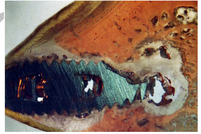
Figure 4: Undecalcified section showing fibrous tissue interface between the implant surfaces and the native bone after 3 weeks of TRI implant insertion.

In group B : After 3 weeks in one of the experimental animals showed that the implant was in its place while the others were displaced from the bone. We found fibrous tissue interface between the implant surfaces and the native bone. As well as areas of woven bone was formed. (Figure 4)